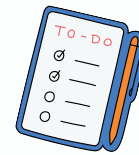
Organization/ To Do list