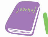
Write in a Journal