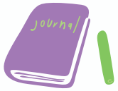
Write in a Journal