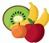
Eat a Healthy Snack