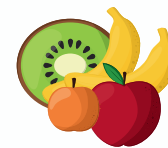
Eat a Healthy Snack