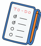
Organization/ To Do list