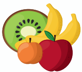
Eat a Healthy Snack